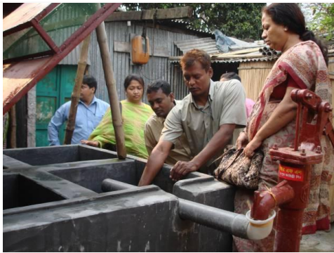
Figure 4: Demonstration of AIRP operation.