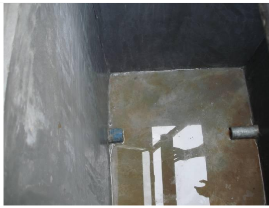
Figure 3: Typical Chamber of a plant.