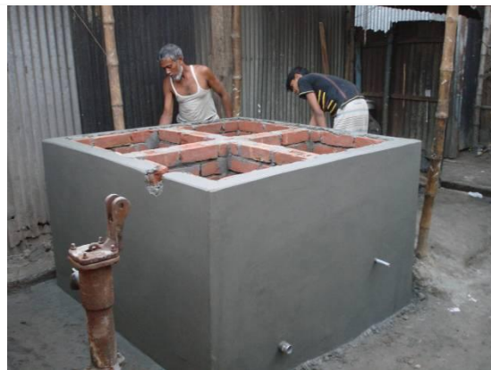
Figure 2: Construction of AIRP.

Note: Proper and timely curing should be maintained during construction for strength and durability of the plant.