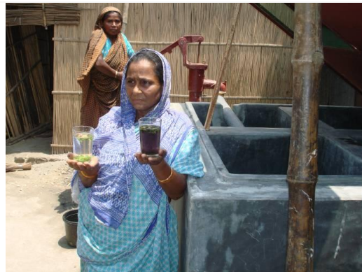
Figure 5: Arsenic removal monitoring with guava leaves.